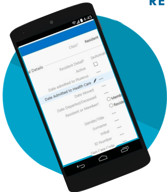
Mobile access for staff on the move